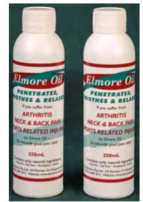
Elmore Massage oil

Elmore oil is blended using a process called Triple Maturation which binds the ingredients to the base oil. This creates a product that acts as a circulatory stimulus and allows rapid pain relief into the affected areas.